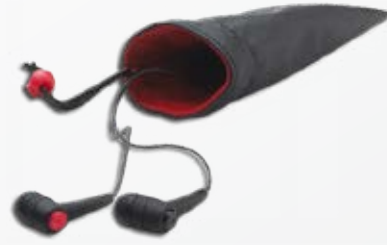
ThinkPad In-Ear Headphones with microphone (57Y4488)