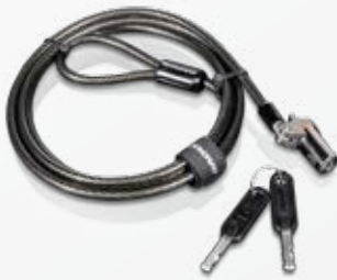
Kensington Microsaver DS Cable Lock (0B47388)